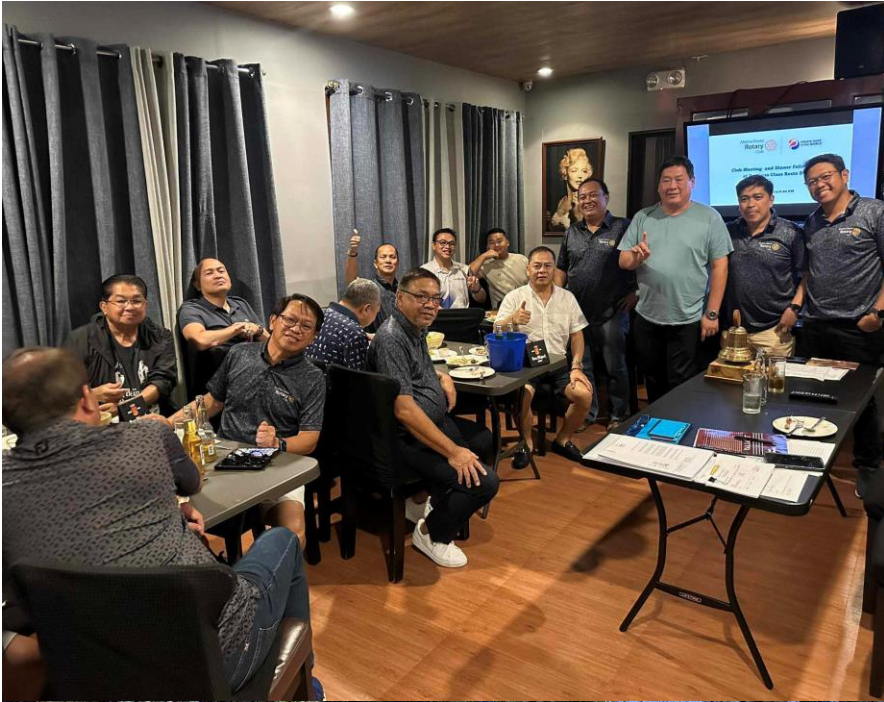
Regular Meeting at Business Class on March 7 & Golf Fellowship at Manolo Fortich on March 12,2024